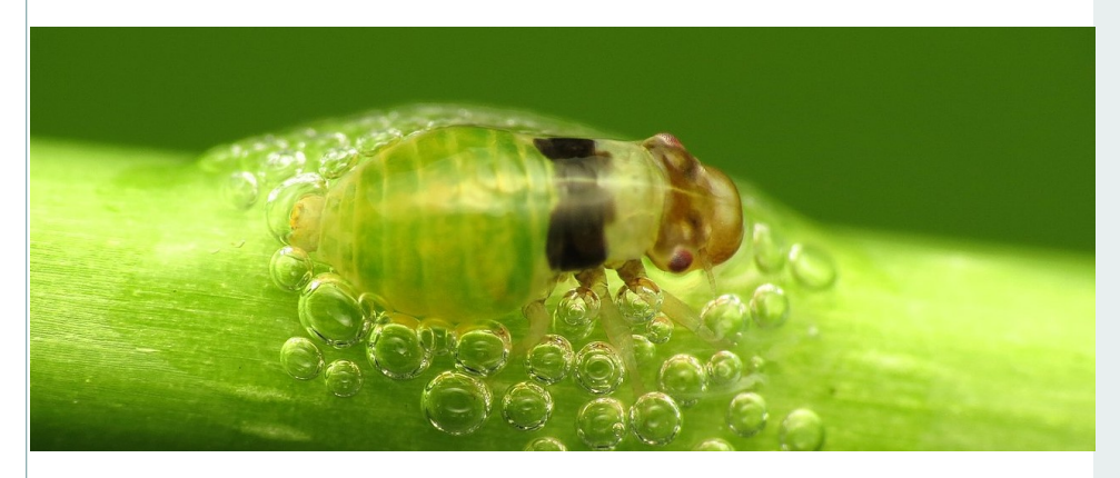
Image below: Spittlebug vector for Xylella fastidiosa.

For more information\ visit:\ https://www.planthealthcentre.scot/projects