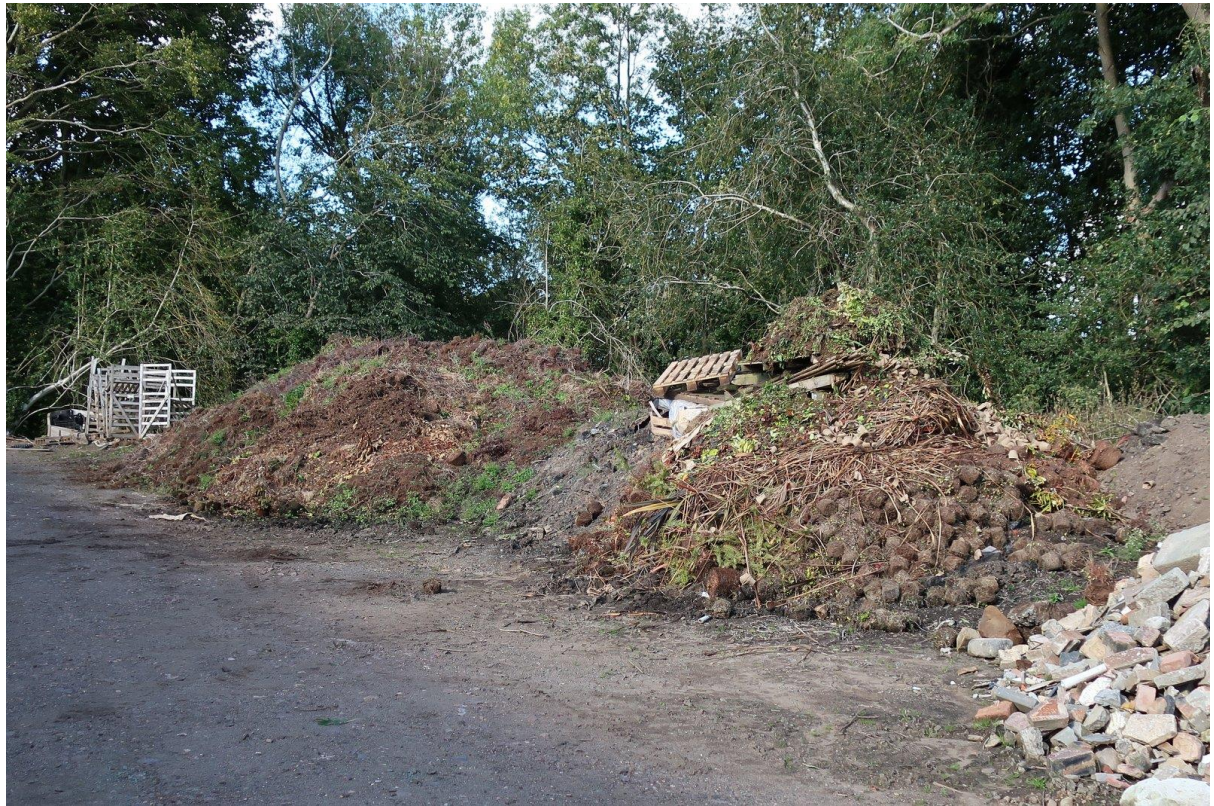
Figure 1. Plant waste dump at a plant production nursery

One of the major hurdles to improving nursery waste management is the limited number of options perceived as being available to nursery managers. One widely recognised standard within the UK organics recycling sector is BSI PAS100 (Publicly Available Specification for Composted Materials) (BSI, 2018). This PAS specifies the requirements for the process of composting, the selection of input materials, the minimum quality of composted materials and the storage, labelling and traceability of compost products. It aims to ensure that the resulting product is safe and reliable.