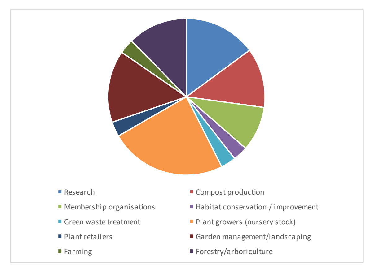
Figure 5 . Sector breakdown of attendees at workshop 2.

A workshop was held to gather data on current knowledge and practices regarding peat-free growing media in Scotland. There were 19 attendees from a wide range of sectors including plant growers (nursery stock) and retailers, garden management/landscaping, farming, forestry/arboriculture, research, compost production, sector membership organisations, habitat conservation/improvement and green waste treatment (Figure 5). These data have been combined with the literature to build up a picture of the current situation.