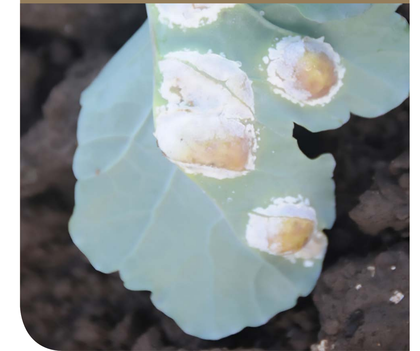
White blister (white rust) Albugo candida