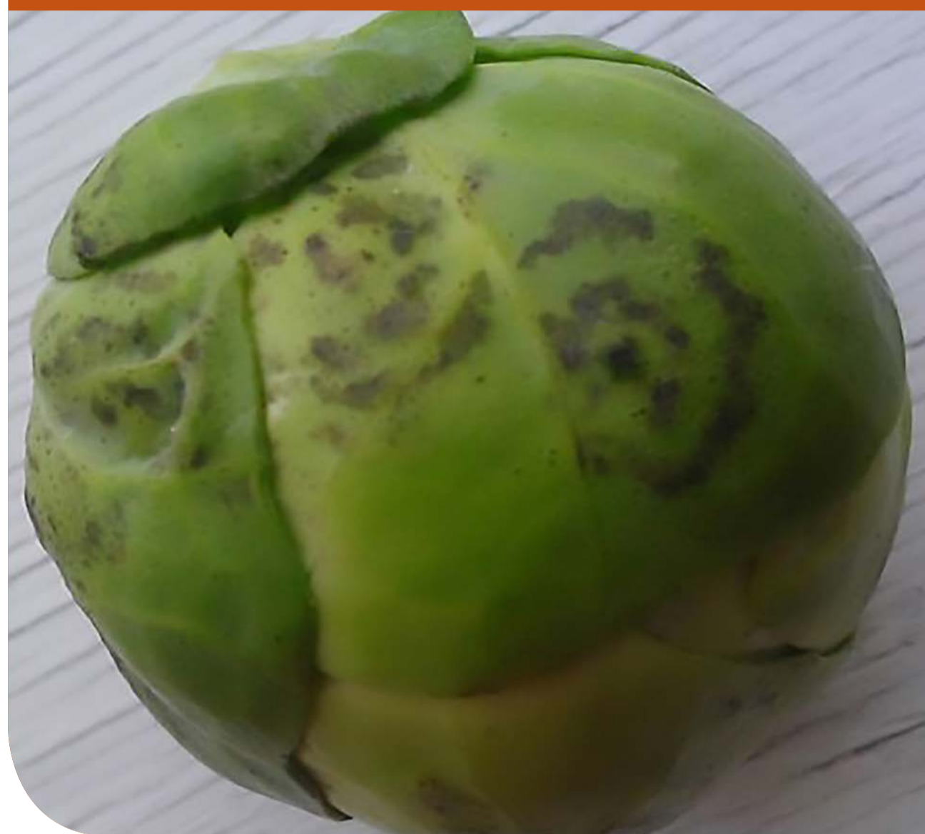
Light Leaf Spot Pyrenopeziza brassicae