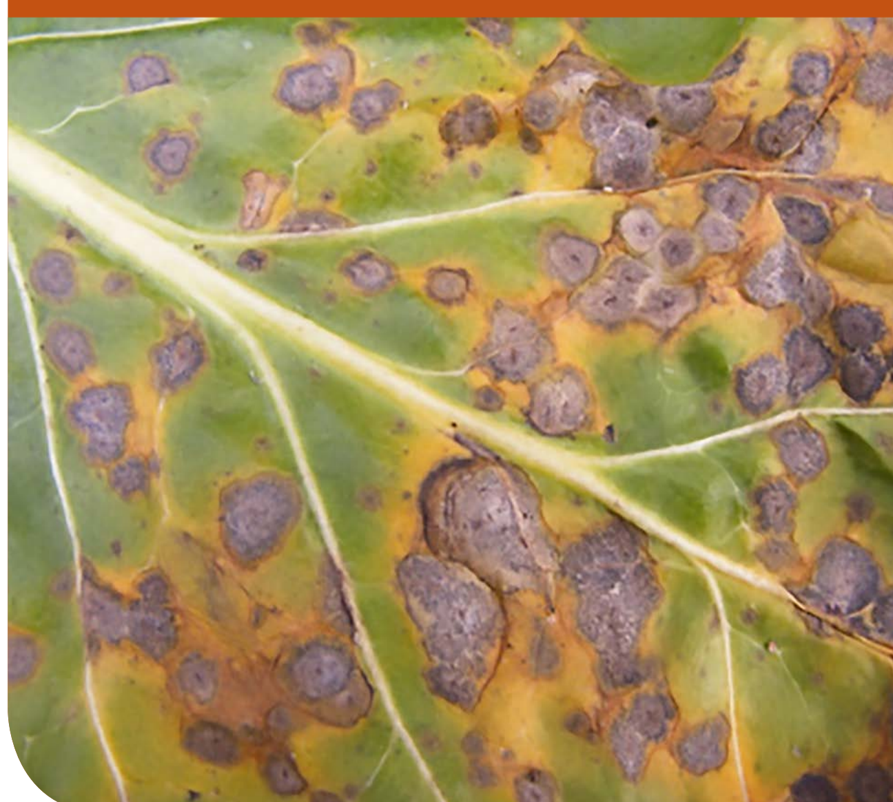
Ringspot Mycosphaerella brassicicola