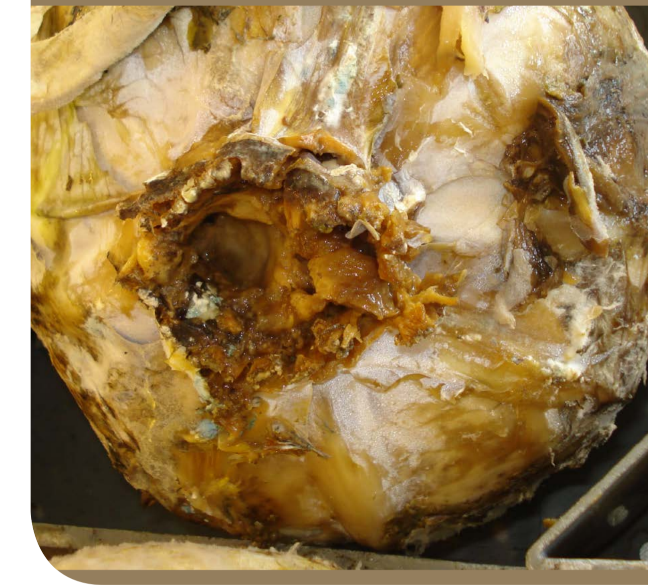
Phytophthora storage rot Phytophthora brassicae