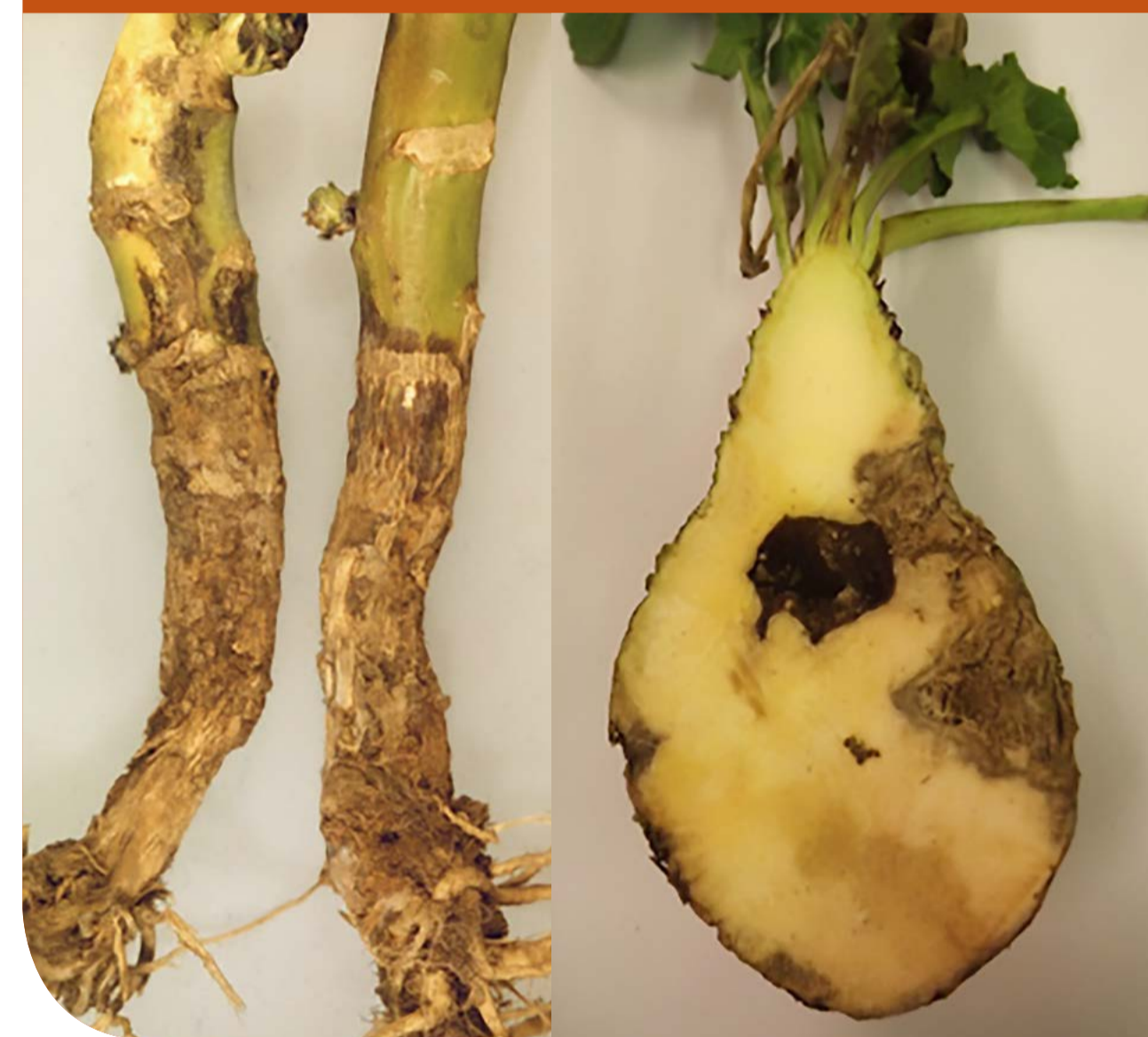
Phoma leaf spot/Canker Phoma lingam