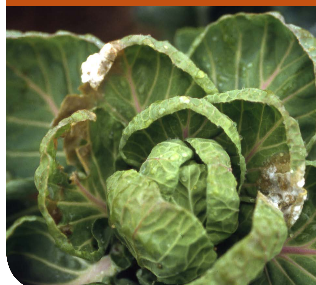
Sclerotinia Sclerotinia sclerotiorum