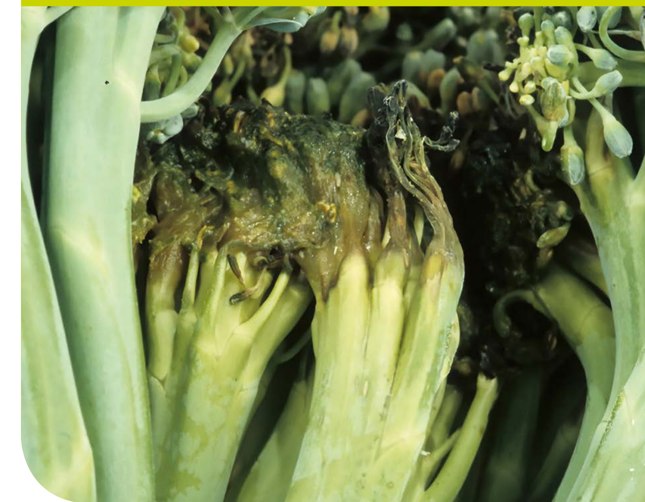
Spear rot Pseudomonas sp.