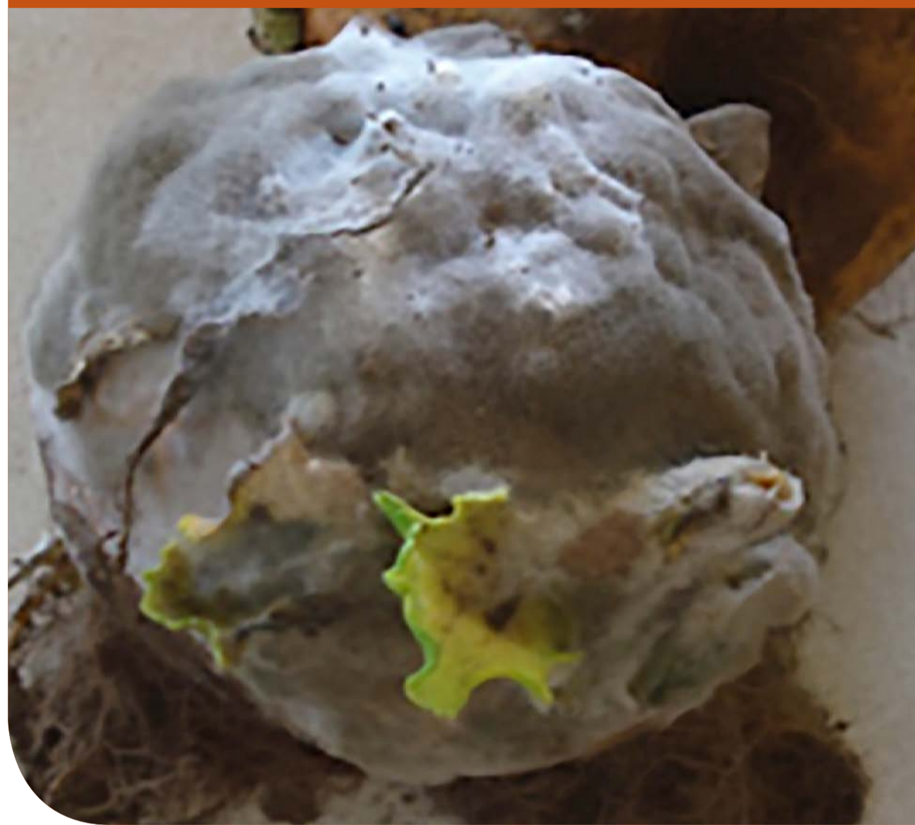
Botrytis (grey mould) Botrytis cinerea