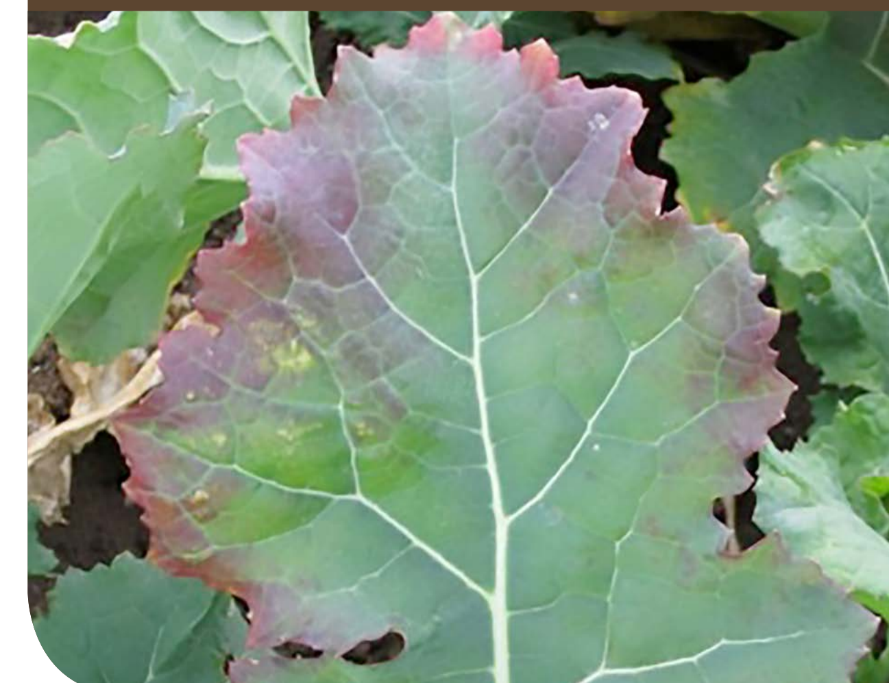
Turnip Yellow virus (TuYV)

Check out AHDB's Brassica Crop Walkers' Guide for full descriptions of all the Brassica diseases.