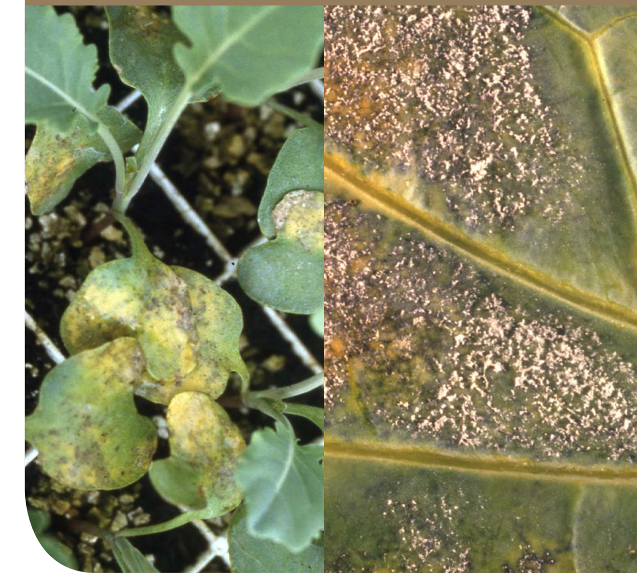
Downy mildew Hyaloperonospora brassicae