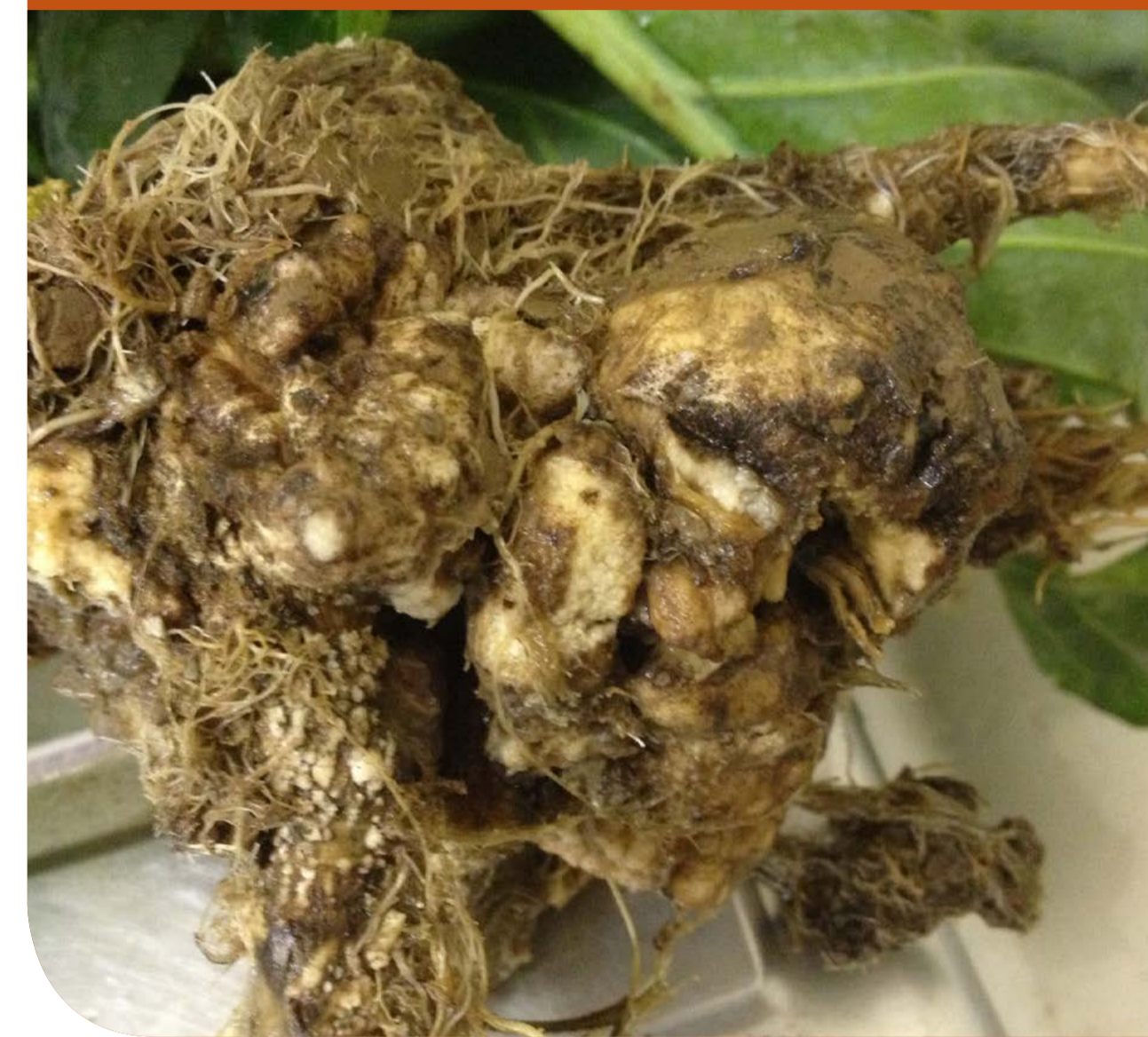
Clubroot Plasmodiophora brassicae