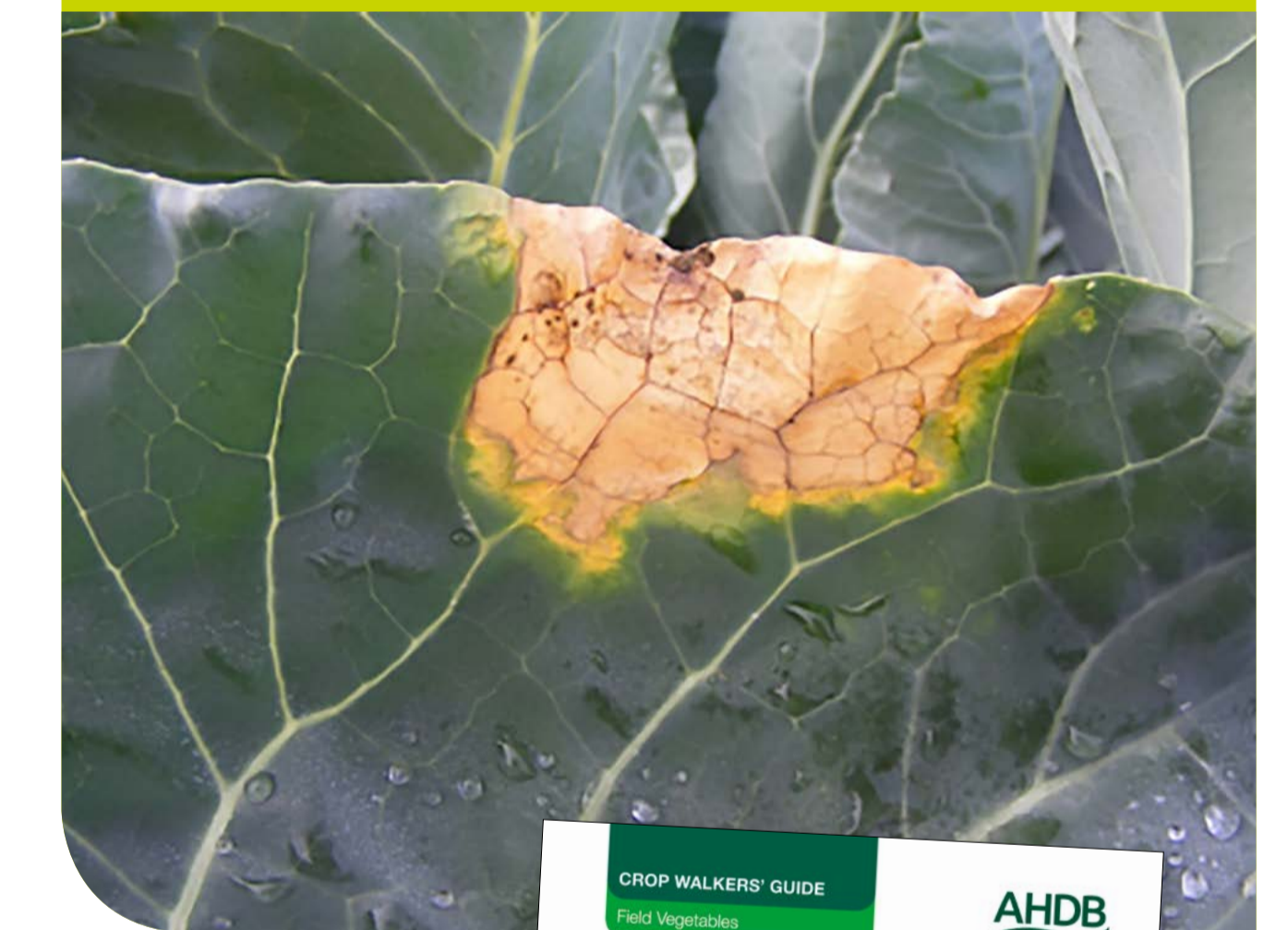
Xanthomonas black rot X. campestris pv. campestris