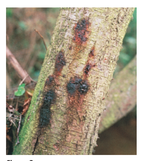
Figure 2 Base of alder stem showing the tarry spots commonly found with Phytophthora disease.

few years the fine twig structure, the bark and eventually the trunk will break up. However, it is quite common for narrow strips of bark to remain alive and to support a limited growth of new shoots from the trunk and major branches.