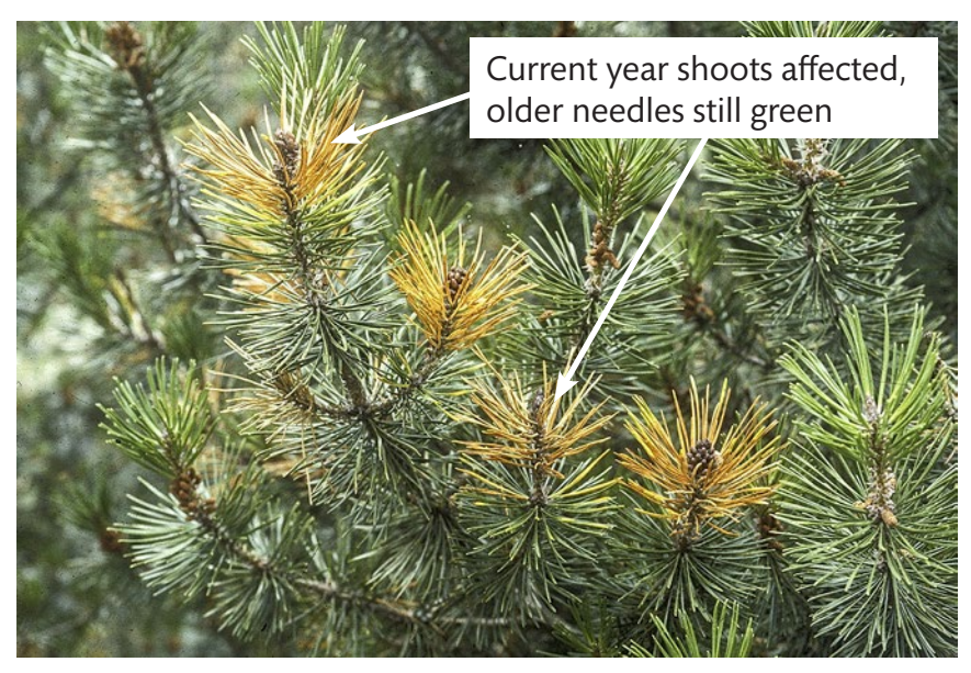
Shoot disease: Ramichloridium pini.