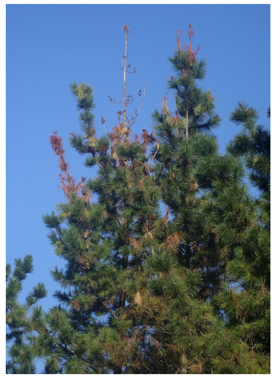
Dieback of shoots (Pinus radiata).