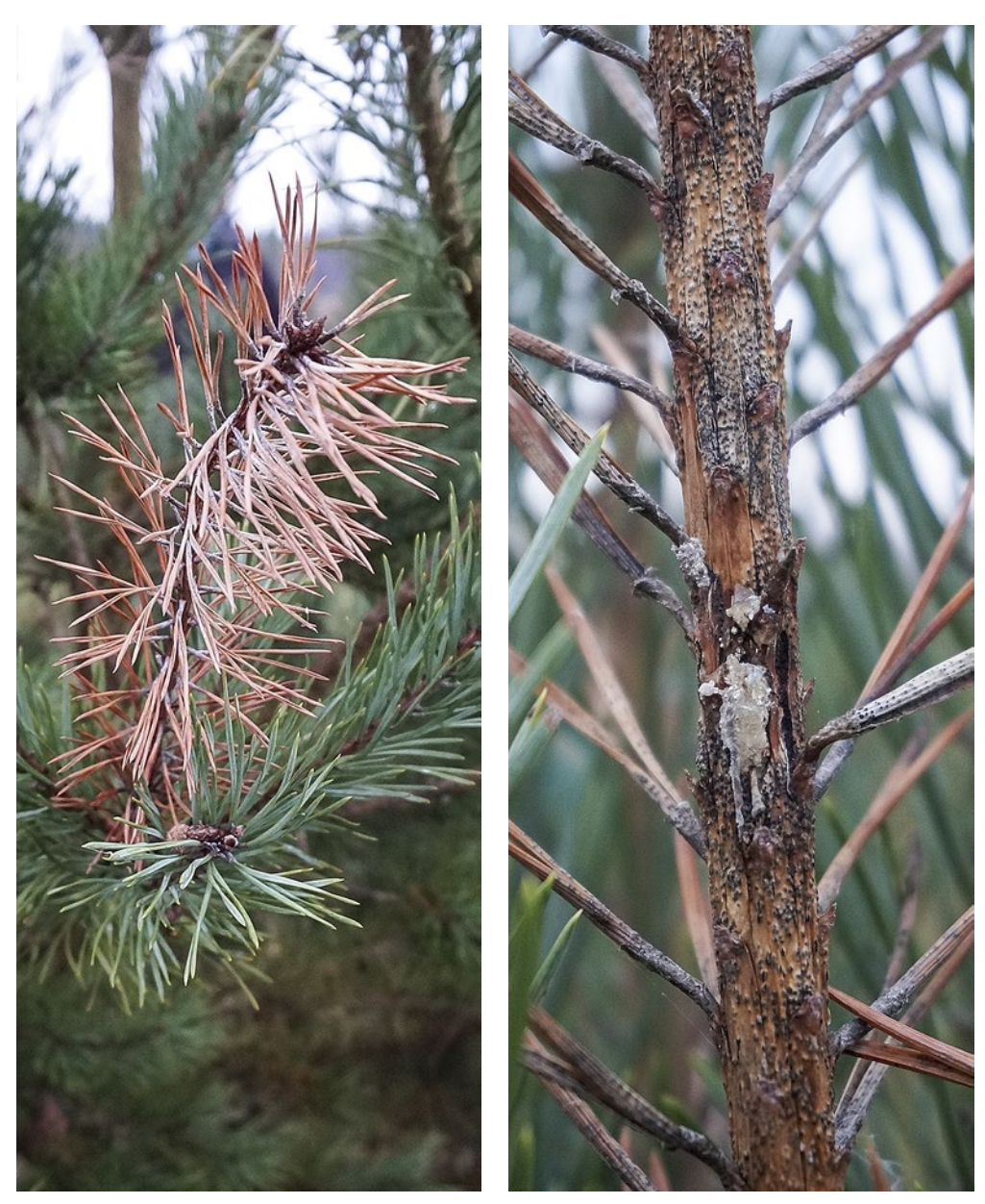
Shoot disease and canker: Diplodia sapinea.