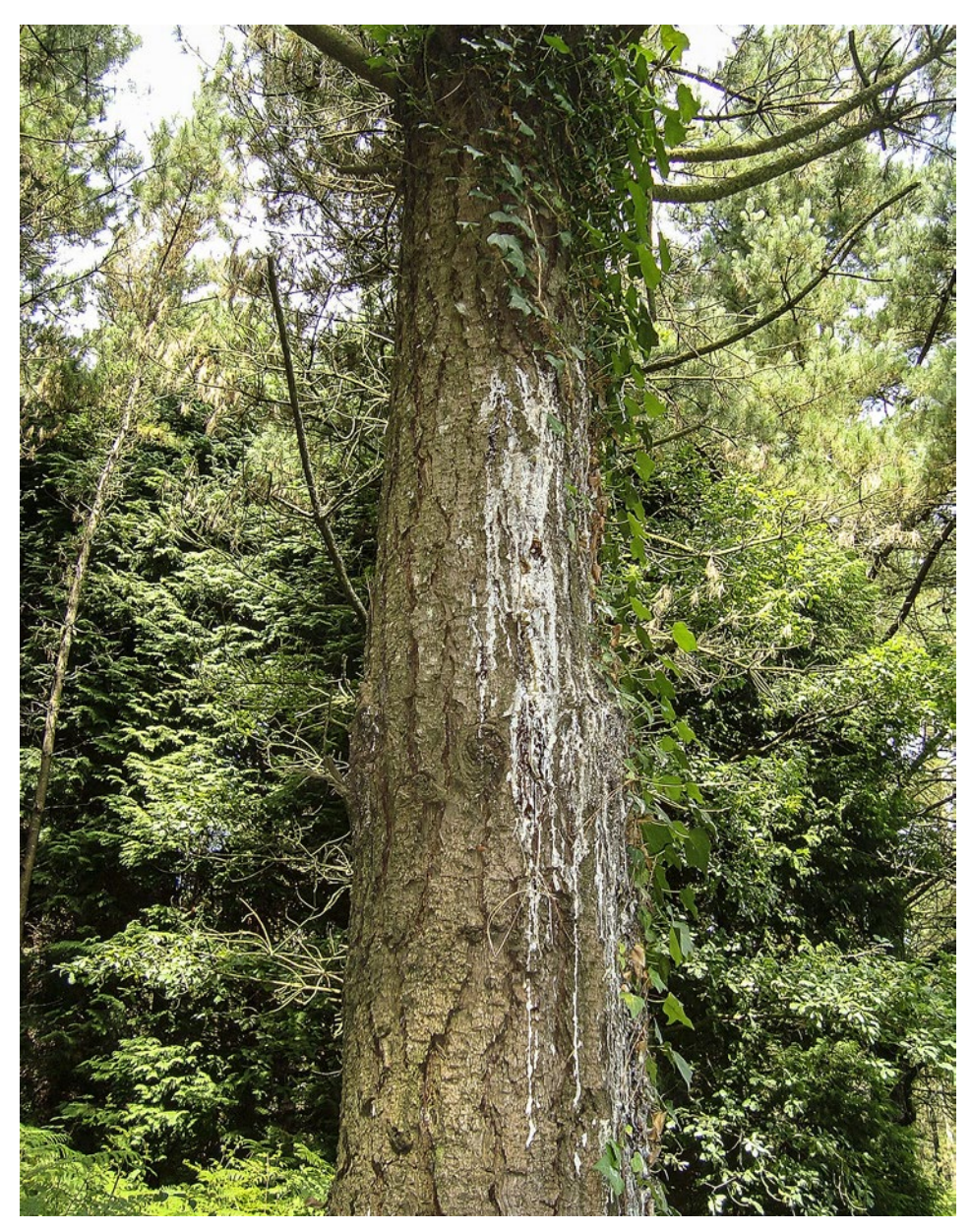
Resin bleeding on the stem of Pinus radiata.