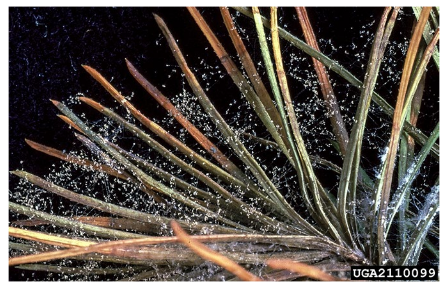
Damping off: Botrytis spp. on Pinus sylvestris.