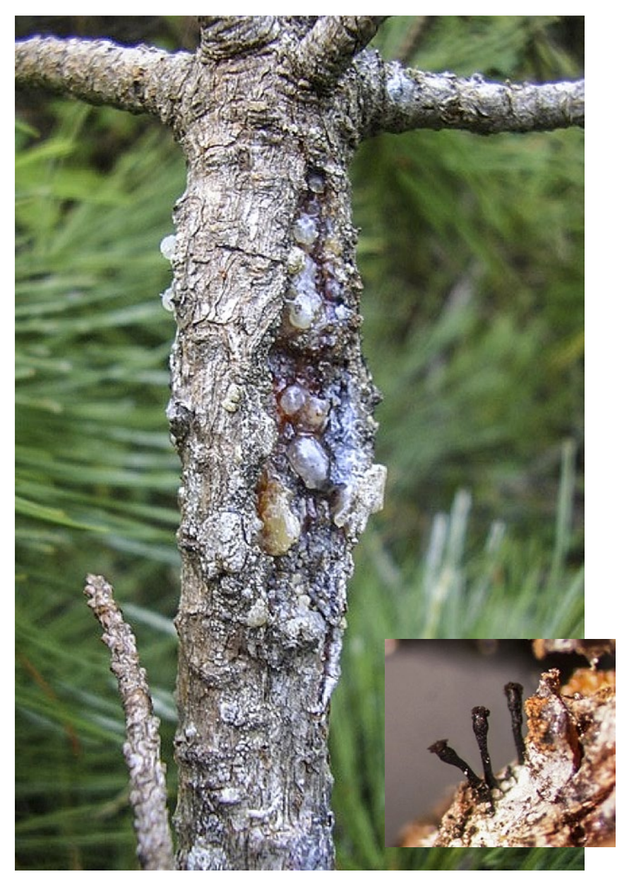
Canker pathogen: Caliciopsis pinea.