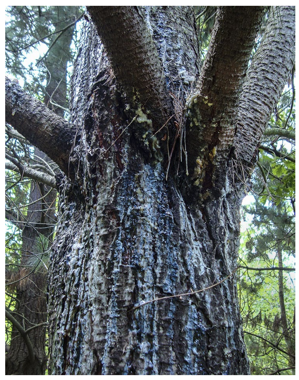
Resin bleeding on the stem of Pinus radiata.