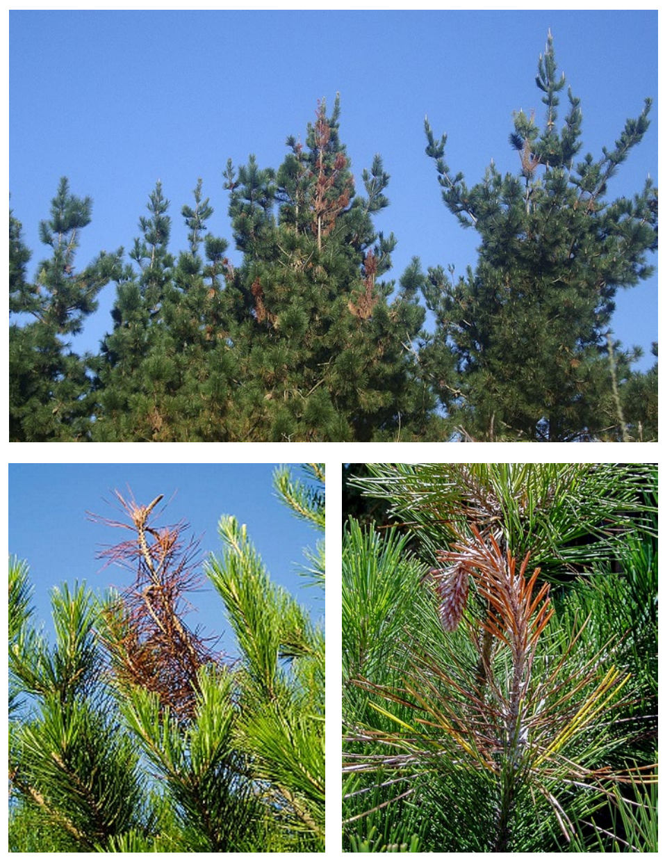
Dieback of shoots (Pinus radiata).