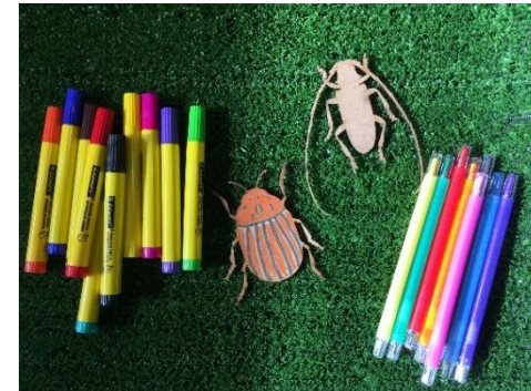
Plant health crafts at events