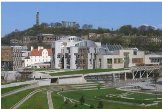
Parliamentary reception 22 nd April