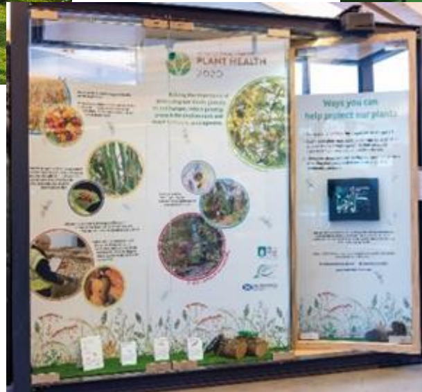
Biosecurity exhibition RBGE