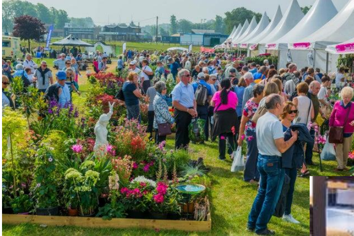
Gardening Scotland - show garden