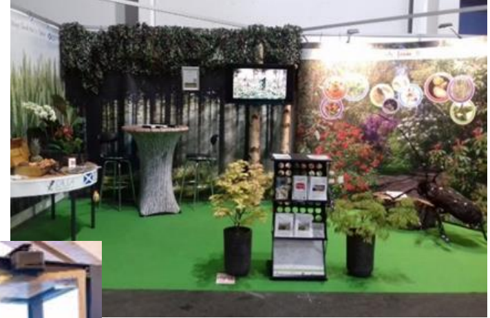
Dundee Flower & Food Festival